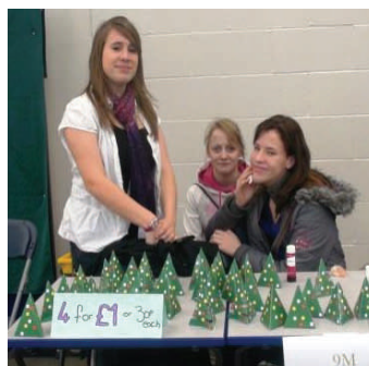
Christmas Market 2009

Pupils at Oasis Academy Brightstowe raised £647.92 for charity through their efforts at the Enterprise Christmas Market held last term. The money raised was split between charities nominated by pupils and our Academy charity, Stop the Traffik.